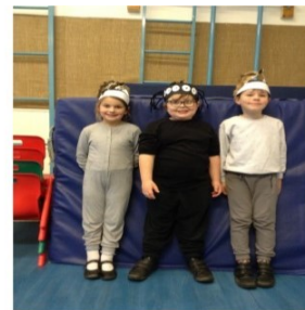
Away in the Manger