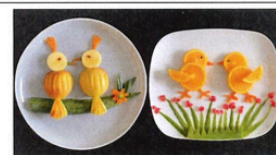
Plate Art ideas

*Remember to sow your cress at least two weeks before the show